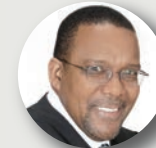
Hon. John Milton Younge Philadelphia Court of Common Pleas

ARBITRATION / MEDIATION DISCOVERY-SPECIAL MASTER SETTLEMENT CONFERENCES APPELLATE and POST TRIAL ADVISING