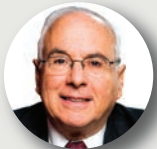
Judge Richard B. Klein (Ret.) The Dispute Resolution Institute