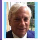
Honorable Ramy I. Djerassi