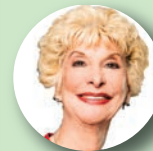
Hon. Sandra Mazer Moss (Ret.) The Dispute Resolution Institute