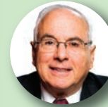
Judge Richard B. Klein (Ret.) The Dispute Resolution Institute