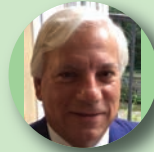
Honorable Ramy I. Djerassi Philadelphia Court of Common Pleas