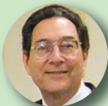
Honorable Arnold L. New Philadelphia Court of Common Pleas