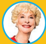
Hon. Sandra Mazer Moss (Ret.) The Dispute Resolution Institute